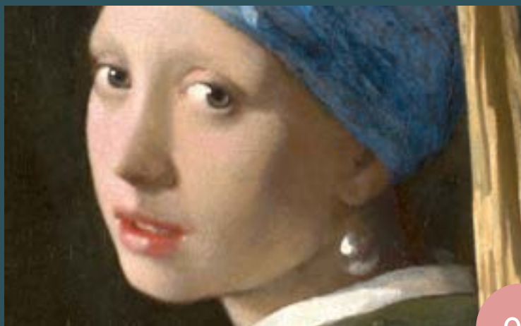
Table of contents About the museum