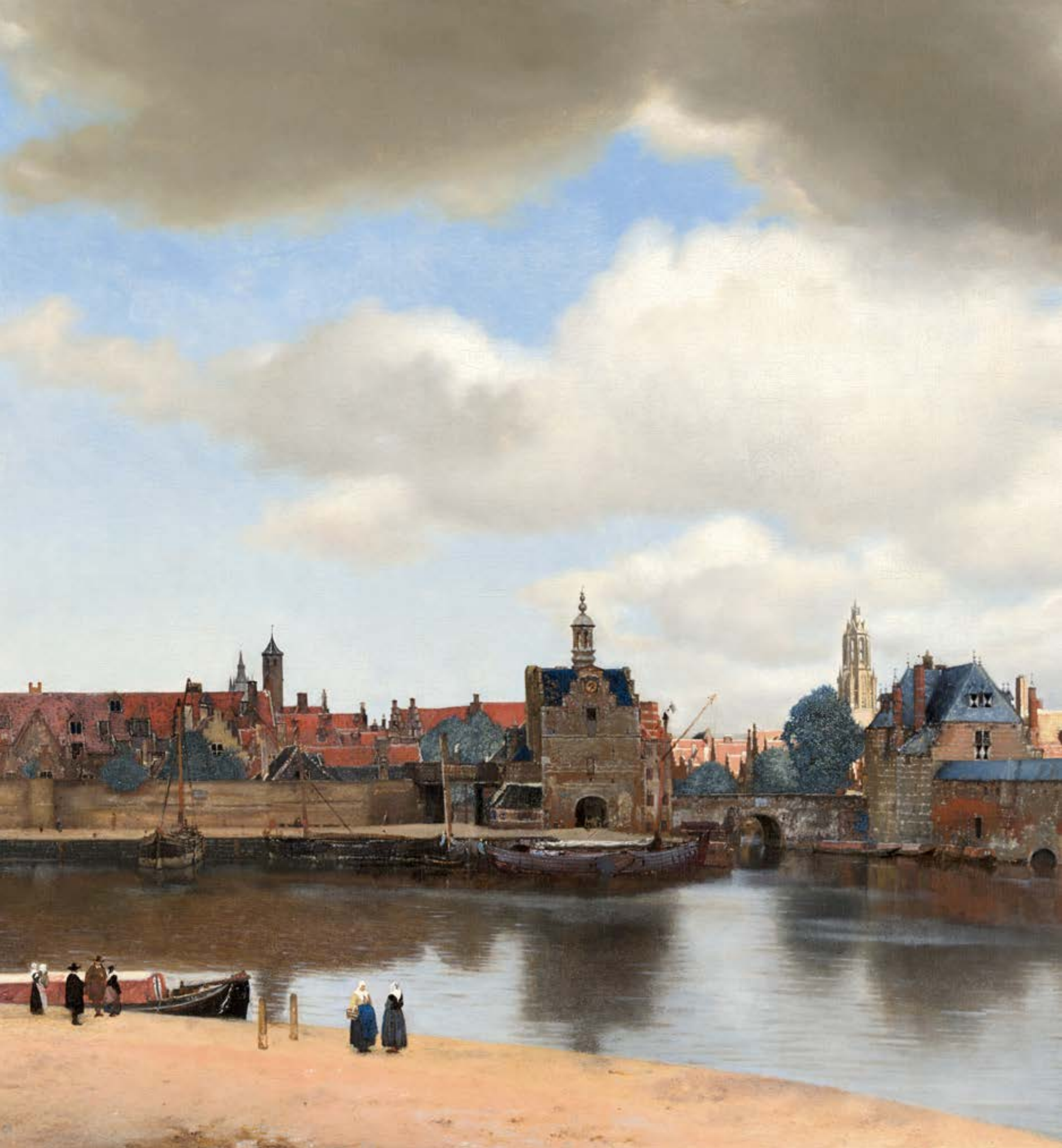
Johannes Vermeer, View of Delft , c. 1660–1661