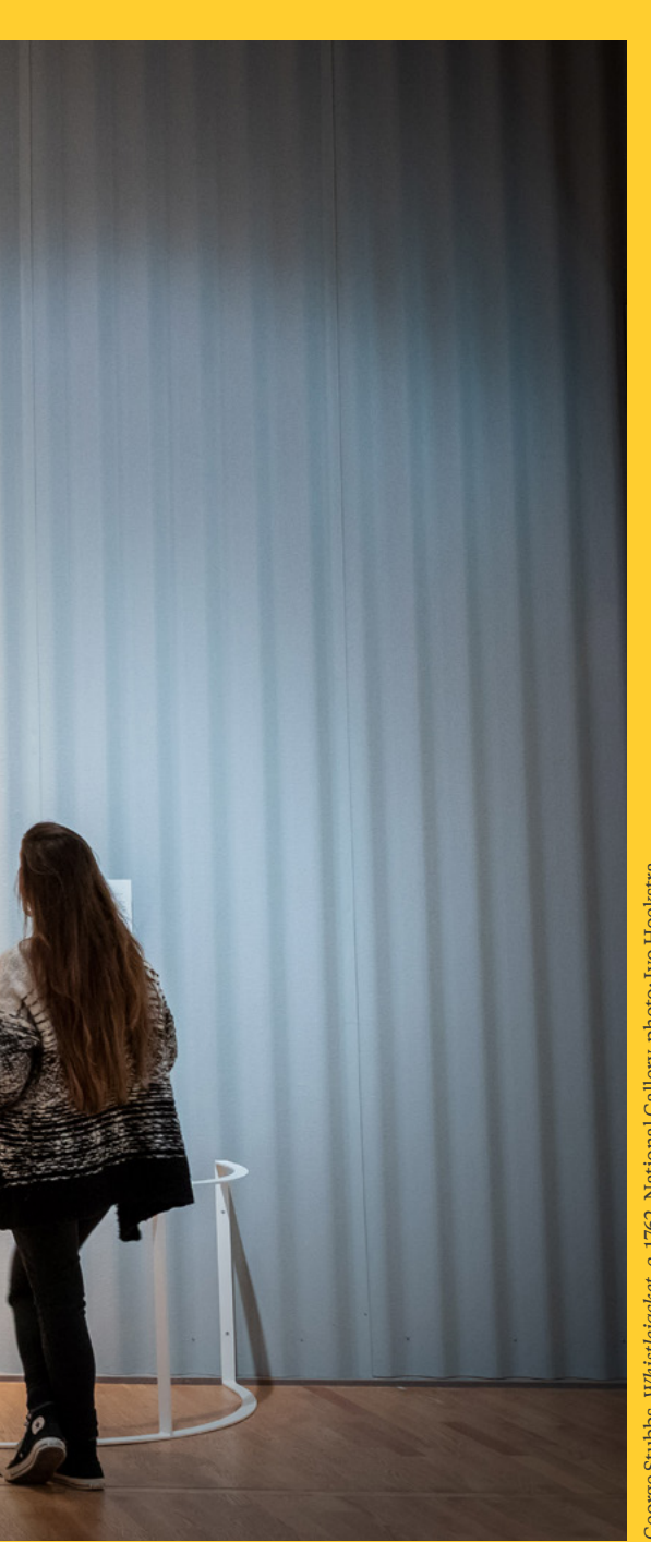
George Stubbs, Whistlejacket, c. 1762, National Gallery