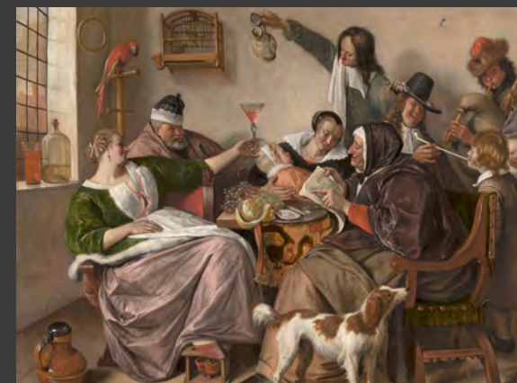
Jan Steen, 'As the Old Sing, So Pipe the Young' , c. 1668–1670

The anniversary year will conclude with a spectacular blockbuster with international appeal!