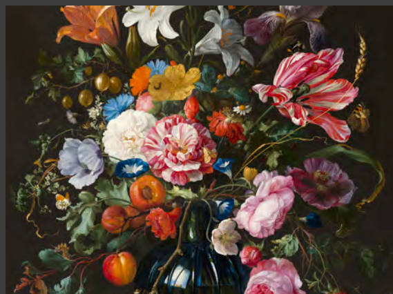
Jan Davidsz de Heem, Vase of Flowers , c. 1670

From 10 February to 6 June 2022 a flower still lives exhibition will be on view in the Mauritshuis. Our collection includes countless colorful and lifelike flower still lifes, with masterpieces by Jan Brueghel, Ambrosius Bosschaert, Jan Davidsz de Heem and Rachel Ruysch. It is not without reason that these painted bouquets are among the most popular works in the collection. Together with loans from all over the world, we tell the fascinating story of this popular genre.