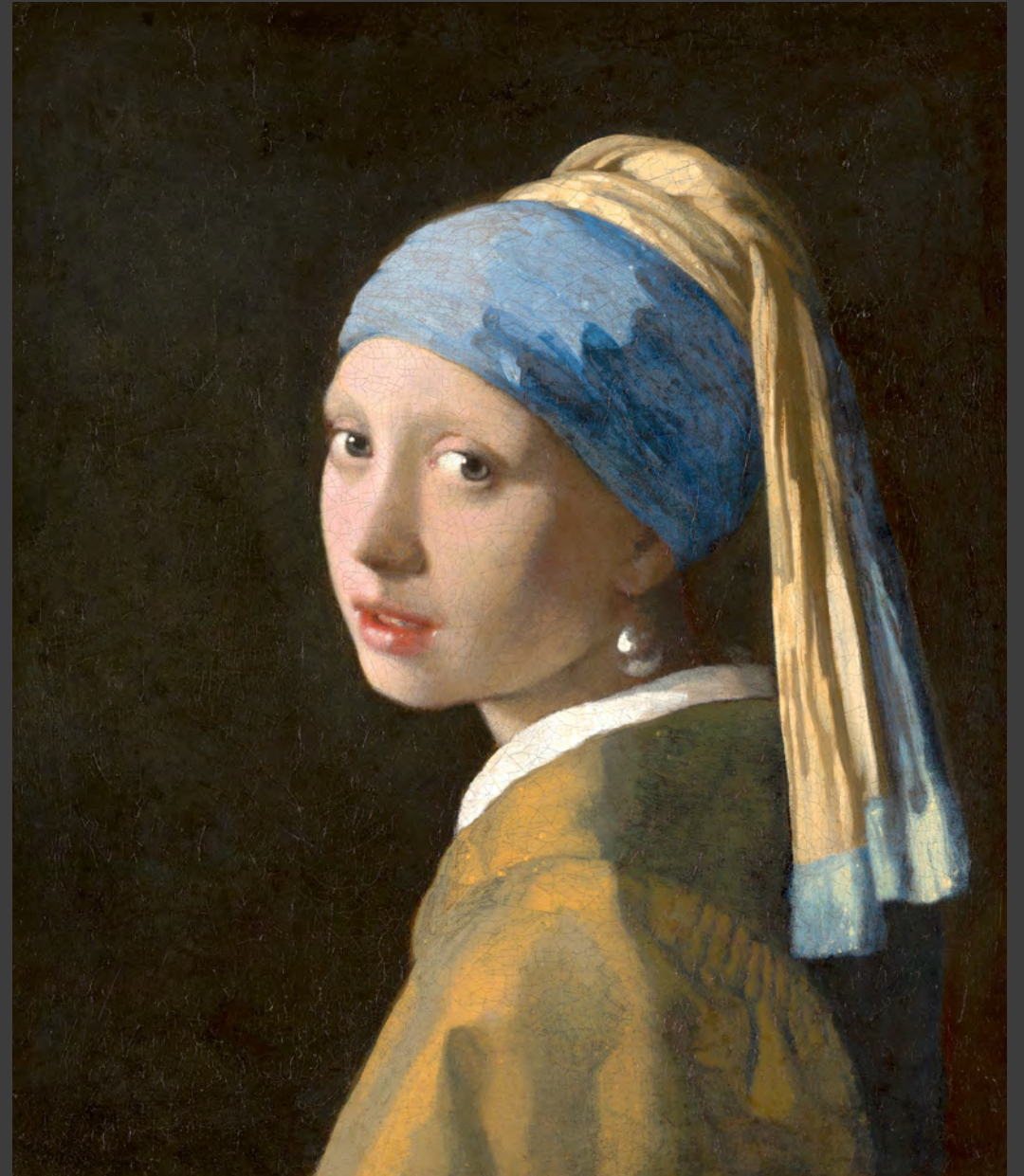
Johannes Vermeer, Girl with a Pearl Earring , c. 1665