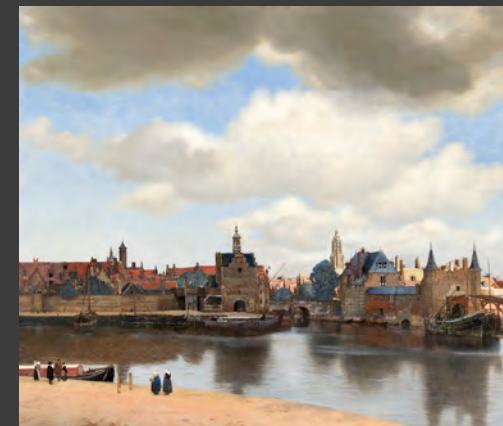
Johannes Vermeer, View of Delft , c. 1660–1661