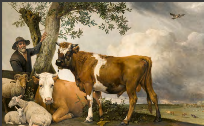
Paulus Potter, The Bull , 1647