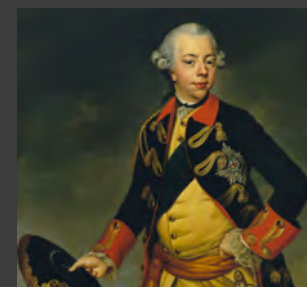
Johann Georg Ziesenis, Portrait of Stadholder William V (1748–1806), c. 1768–1769.

collection in the Netherlands. The prince had the gallery created in 1774 to display his impressive paintings. The walls were crammed full to clearly demonstrate the wealth of his collection.