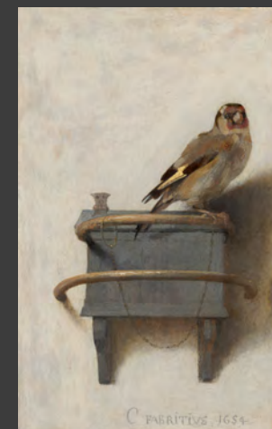
Carel Fabritius, The Goldfinch , 1654