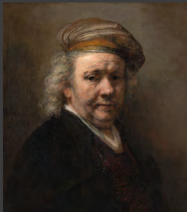
Rembrandt, Self-Portrait , 1669