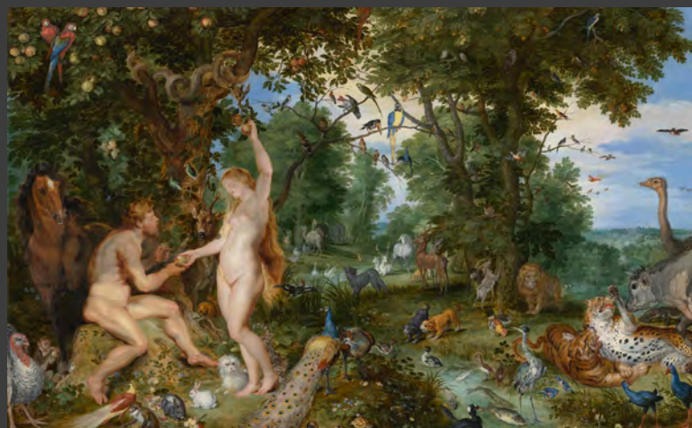
Jan Brueghel the Elder, Peter Paul Rubens, The Garden of Eden with the Fall of Man , c. 1615