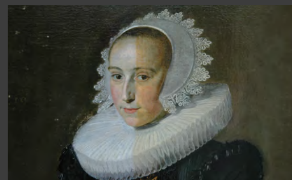
Detail of a painting by Frans Hals, Portret van Aletta Olycan , 1625, during restoration.

In 2021 it will be some 25 years since a conservation studio was installed in the Mauritshuis attic. A team of in-house conservators works there, dedicated to conservation, restoration and research. In Facelifts & Makeovers , the most intriguing restorations of the last twenty years will be unveiled, including paintings by Rembrandt, Vermeer, Hals, Steen and Rubens.