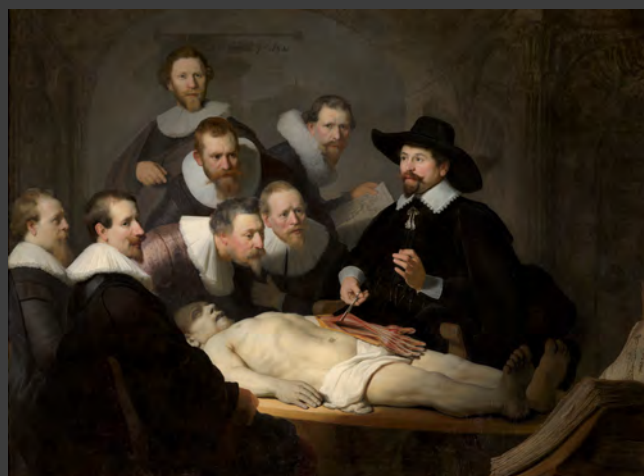
Rembrandt, The Anatomy Lesson of Dr Nicolaes Tulp , 1632