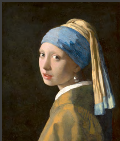
Johannes Vermeer, Girl with a Pearl Earring , c. 1665