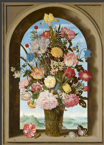
Ambrosius Bosschaert the Elder, Vase of Flowers in a Window , c. 1618