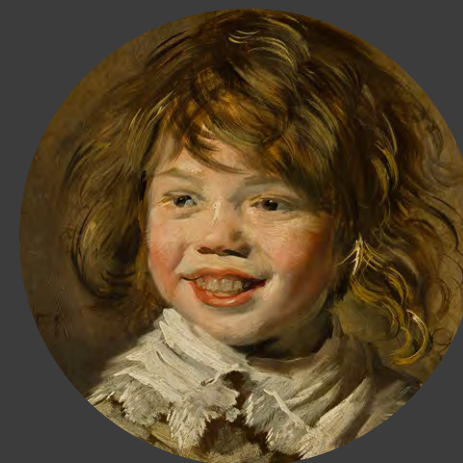
Frans Hals, Laughing Boy , c. 1625