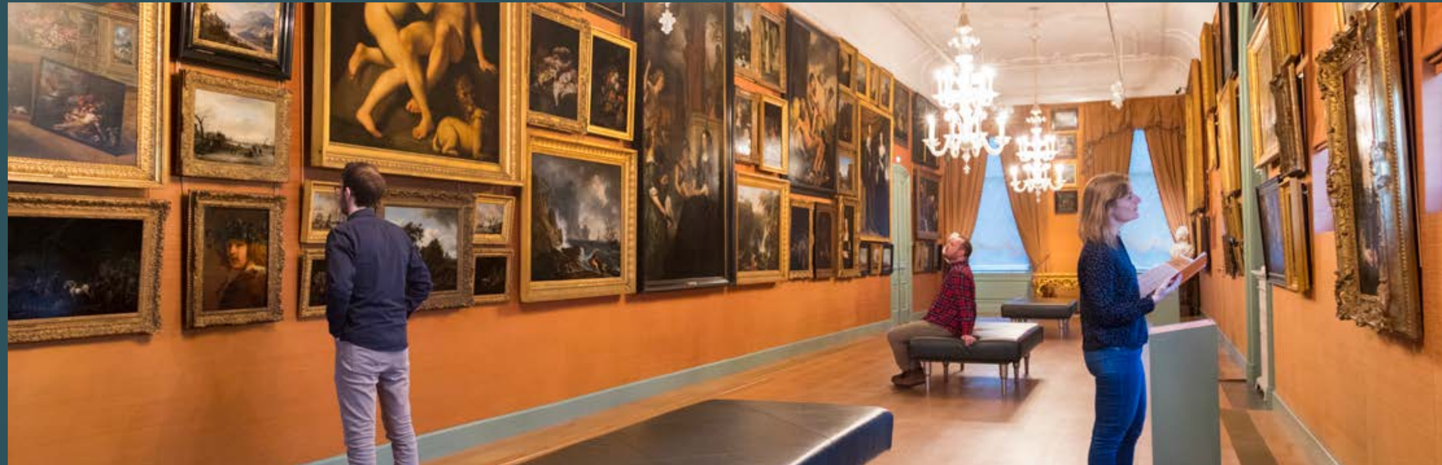
Table of contents →