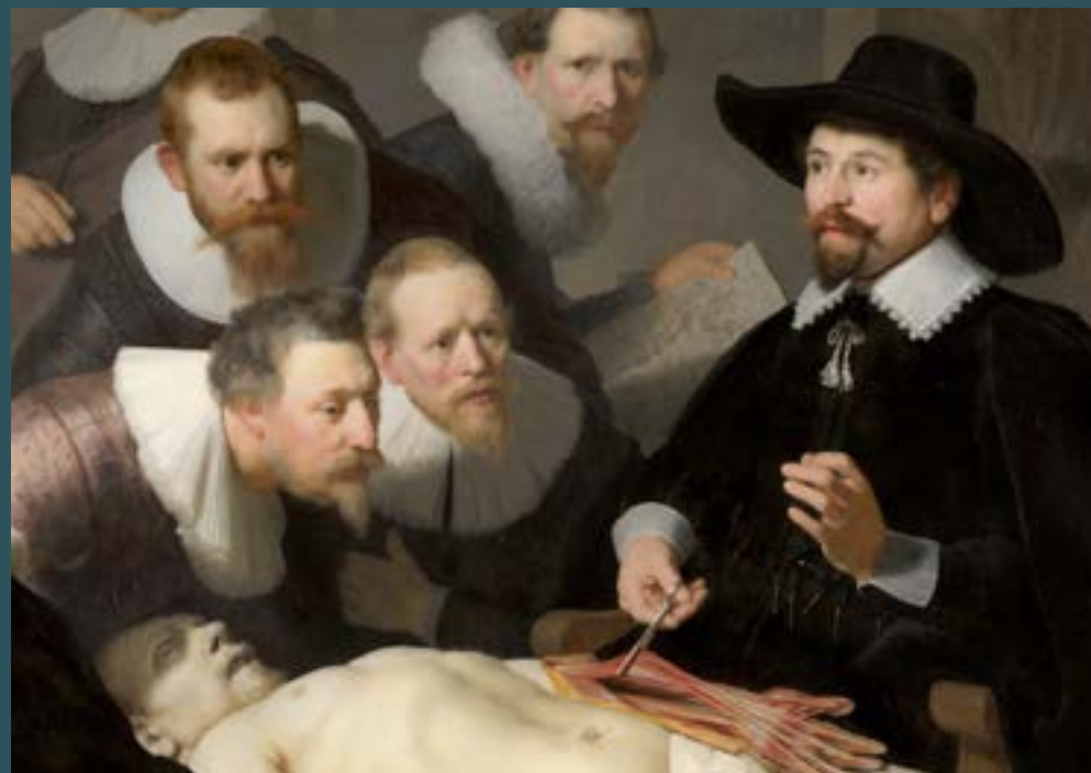
Rembrandt, The Anatomy Lesson of Dr Nicolaes Tulp , 1632