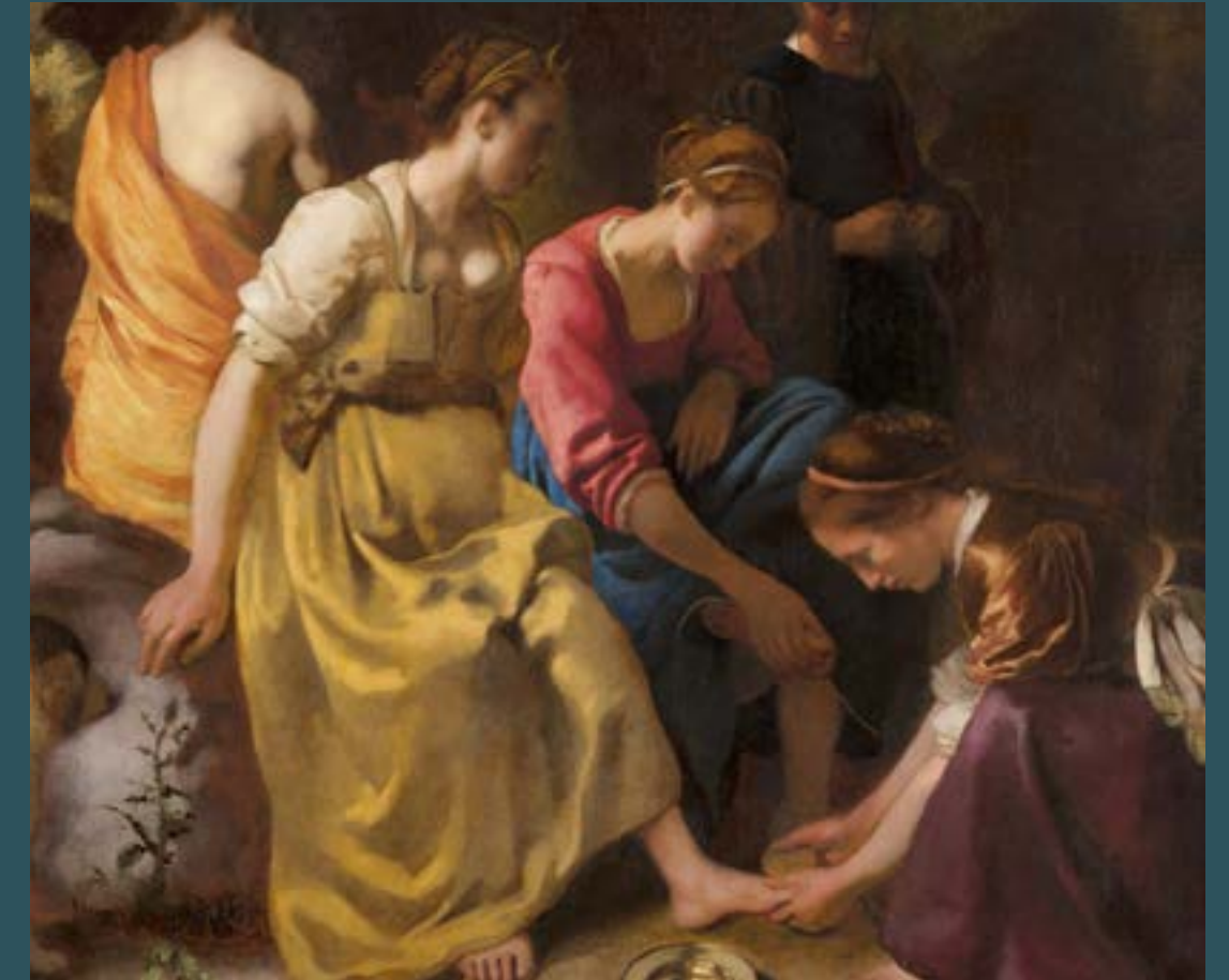
Johannes Vermeer, Diana and her Nymphs , c. 1653-1654