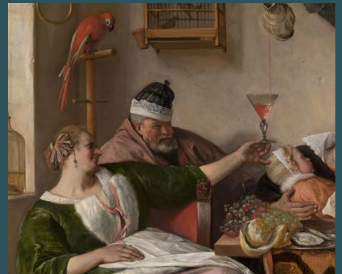
Jan Steen, 'As the Old Sing, So Pipe the Young' , c. 1668-1670