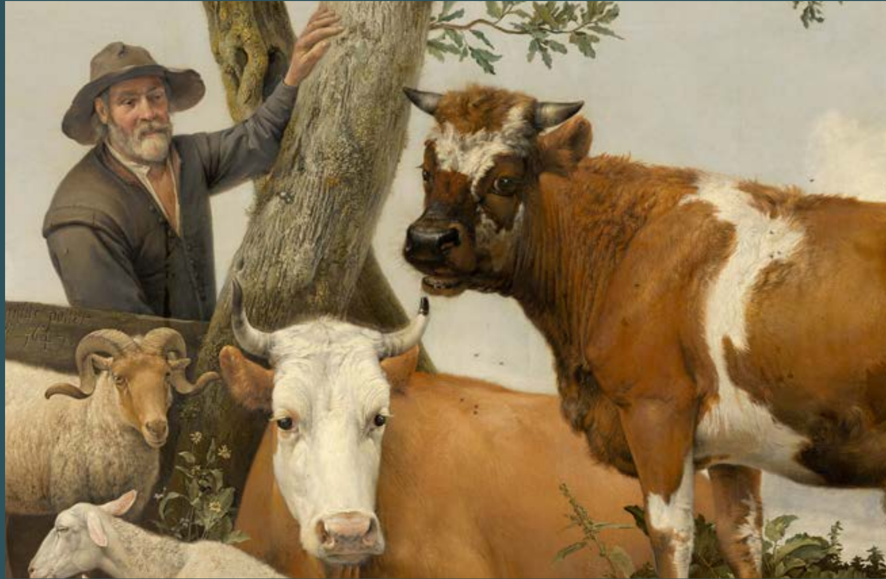
Paulus Potter, The Bull , 1647