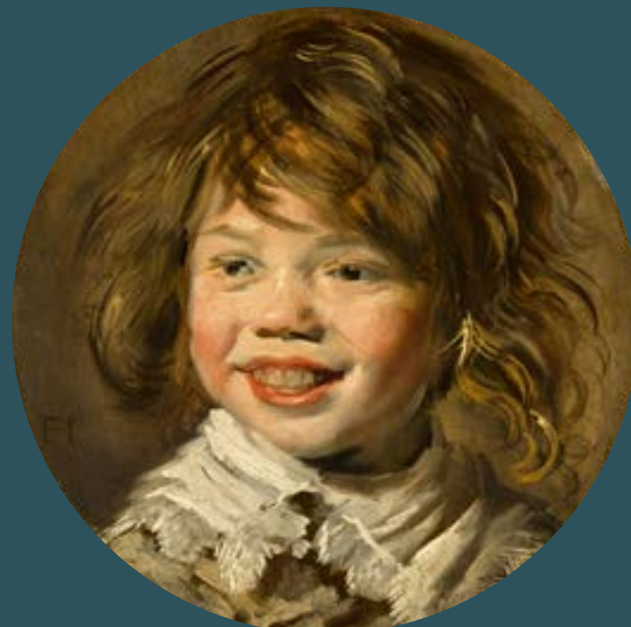
Frans Hals, Laughing Boy , c. 1625