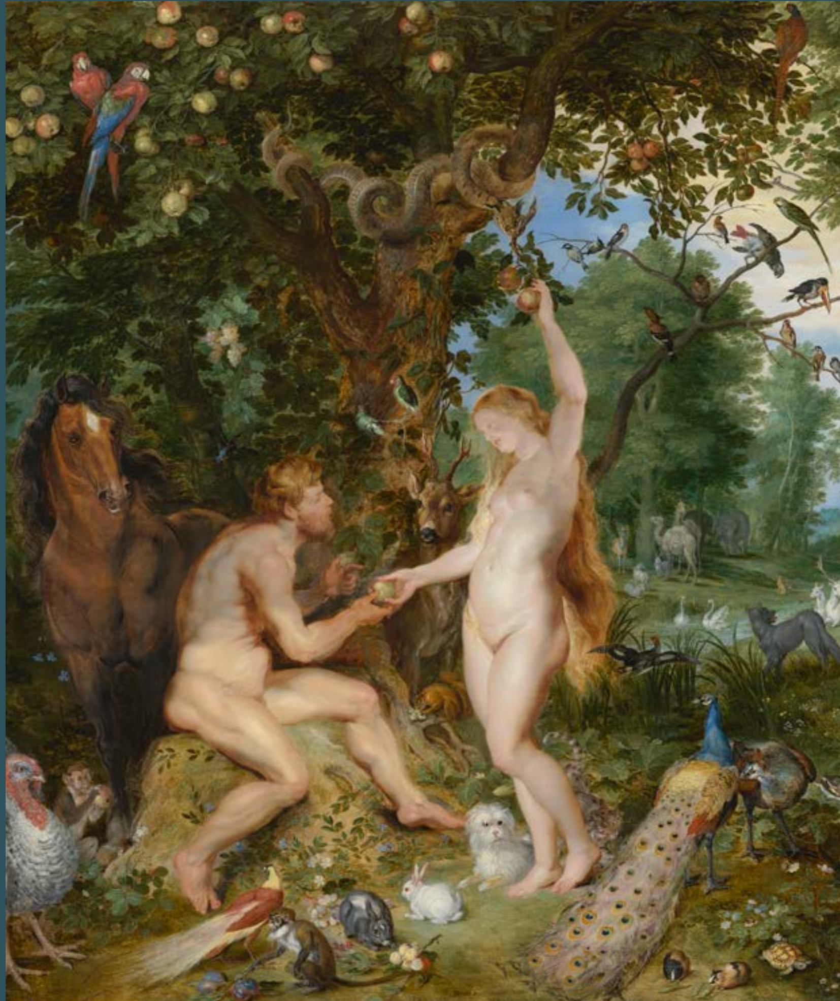
Jan Brueghel de Oude & Peter Paul Rubens, The Garden of Eden with the Fall of Man , 1615