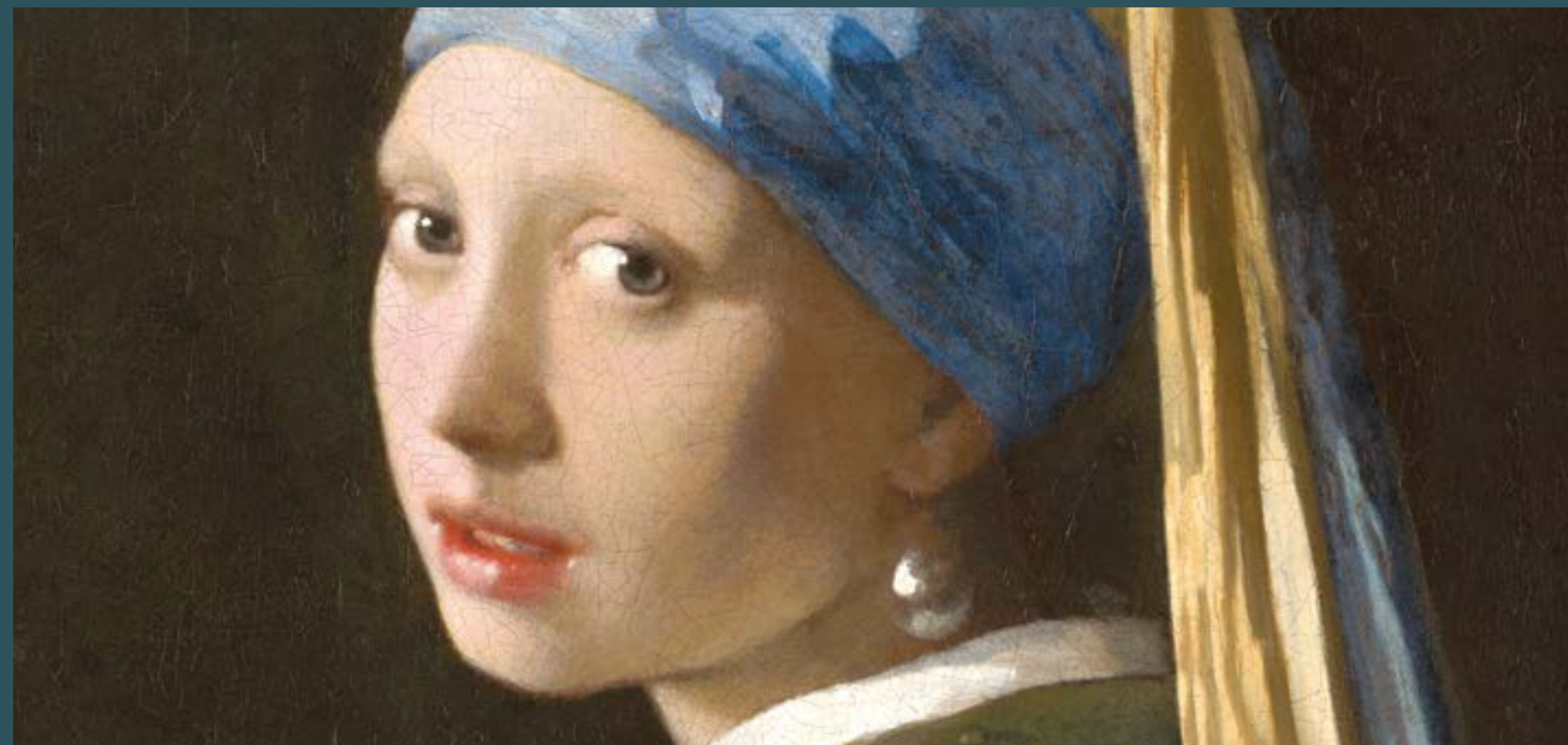
Johannes Vermeer, Girl with a Pearl Earring , c. 1665

The Mauritshuis is home to the best of Dutch and Flemish painting of the seventeenth century. In 90 minutes, you can discover famous works by Vermeer, Rembrandt, Frans Hals, Fabritius and Rubens in the classical rooms of this magnificent city palace in The Hague