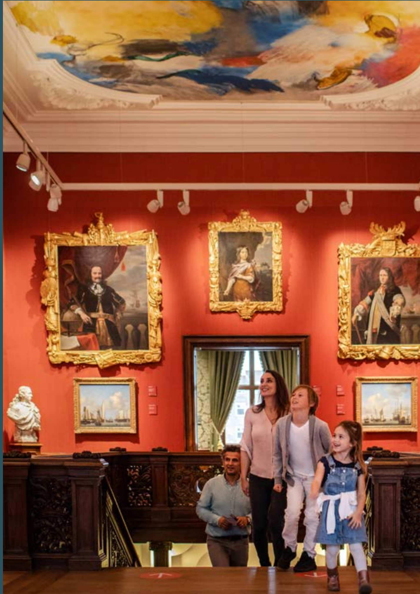
Table of contents →