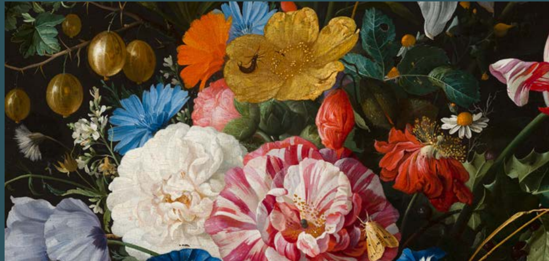
Jan Davidsz de Heem, Vase of Flowers , 1670